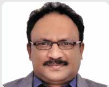
Shri. Sheik Lateef, K.A.S Registrar, Bangalore University

Bangalore University has a long-standing reputation for academic excellence, with an accreditation and endorsement of the National Assessment and Accreditation Council (NAAC), coupled with the highest grade of A++ and a Cumulative Grade Point Average (CGPA) of 3.75 out of 4 and poised to elevate the standards of distance education.